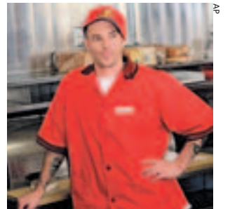
Federline in fast-food gear