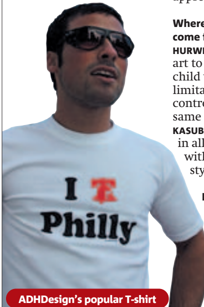
ADHDesign's popular T-shirt